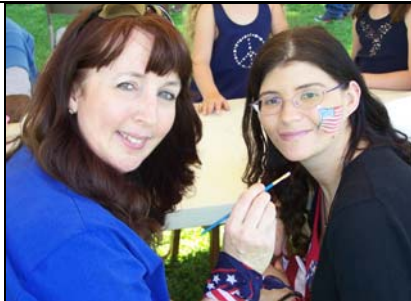
The Annual Memorial Day Picnic has been co-sponsored by Upland Baptist and Resurrection Life Churches for the past decade, with the face-painting table being almost as popular as the free food.