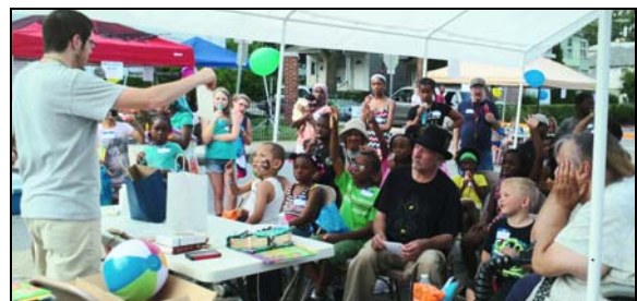
The Community Block Party sponsored by Resurrection Life Church on Aug. 9 once again drew a sizable crowd.