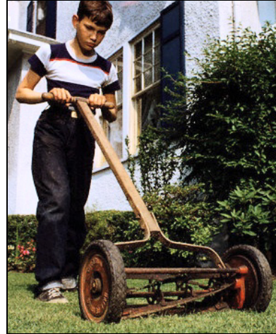
...When boys this age were willing to do hard labor to earn their allowance.