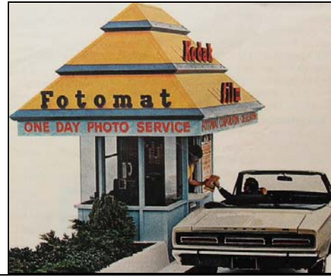
...When 'developing' those photos that you had shot on vacation ONLY took one full day – It was a miracle!