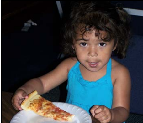
Among the impressive magic tricks were the mysterious disappearance of seven pizzas and three tubs of ice cream.