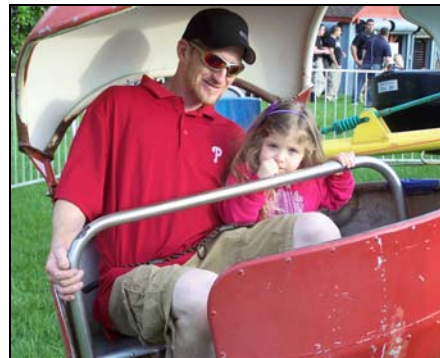
The food and fun were both offered up in abundance when the Carnival returned to Bristol Lord Field from May 20-24.