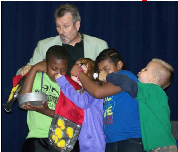
A new summer activity for Upland youth was brought to MacQueen Hall on Aug. 23, when the Community Affairs Committee sponsored a kid-friendly magic show.