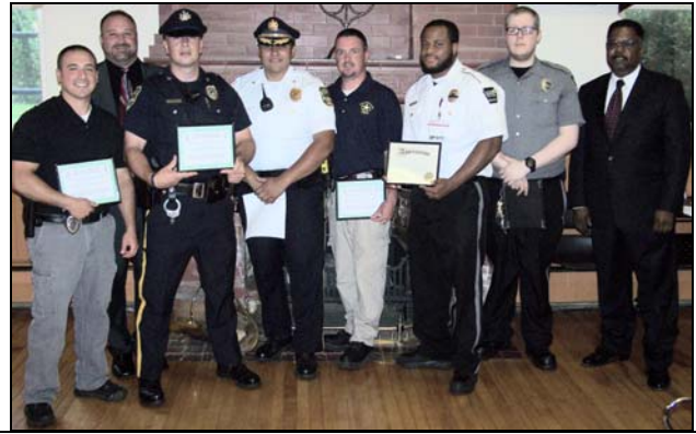
Four Upland police officers and two Crozer-Chester Medical Center security guards were recognized for their extraordinary actions at the July 8 Borough Council meeting.