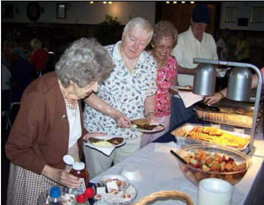
About 60 Upland senior citizens took the Borough up on its offer of a free breakfast on July 28.