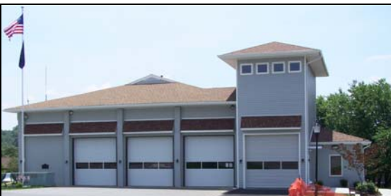
The new and improved home of Upland Fire Company No. 1