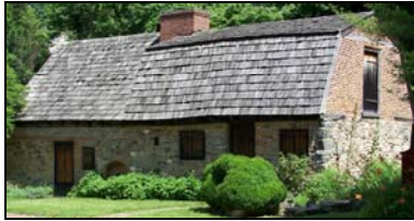
The Caleb Pusey House