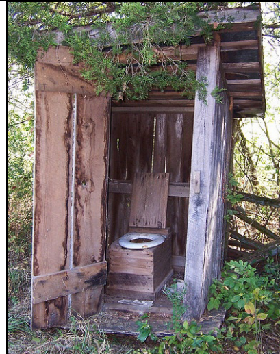
...When every home in Upland Borough had one of these in the backyard. Believe it or not, that was only about 80 years ago!